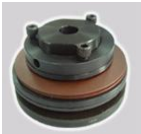
RTL127-1 RTL127-2 RTL178-1 RTL178-2