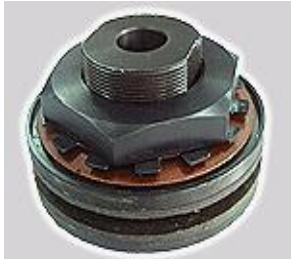
RTL65-1 RTL65-2 RTL89-1 RTL89-2